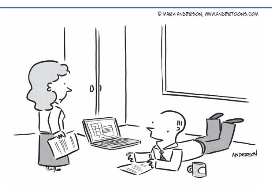
"I've tried regular desks, and standing desks, but I found just plain old laying on the floor works best for me."

If your child becomes the target, you can try to get your school involved, but many schools have been shot down, even sued, for trying to interfere. If the abuse becomes physical, sexual or threatens physical or sexual harm, call the police. The schools aren't equipped to handle that level of abuse. The police are.