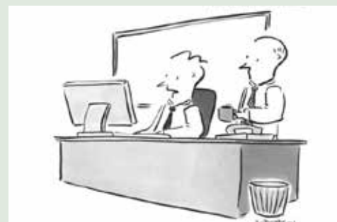
"I got my e-mail's read receipt back, I just wish I had an understand receipt."